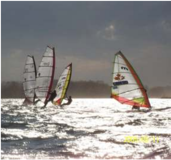
Hayes crosses the fleet on port at the start of a May TWC Wed - nighter.