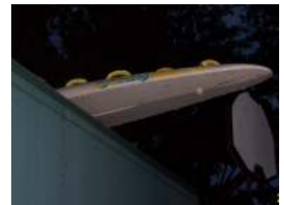
Well ,since TWC is out of storage spaces, maybe nobody will notice if I leave it here!