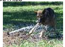
How come nobody else plays with this? This is a great toy!