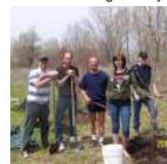
TWC poplar planters