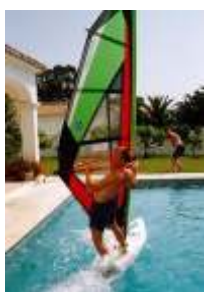
Theses guys are really desperate for wind!