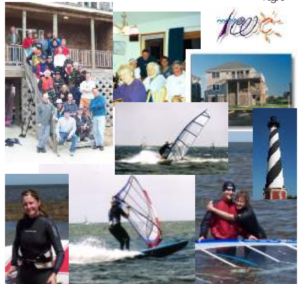
Hatteras 2003 and 2004

At the time of writing, our 2005 Hatteras Expedition has 49 sailors paid up. April 9-16, 2005 we have four soundfront homes on Island Creek and April 16-23, we have two Island Creek soundfront homes. We have two empty spots in week one and week two is full. Haven't been to Hatteras? You've missed some of the best windsurfing in N. America. For more info, see www.torontowindsurfingclub.ca and click Hatteras 2005.