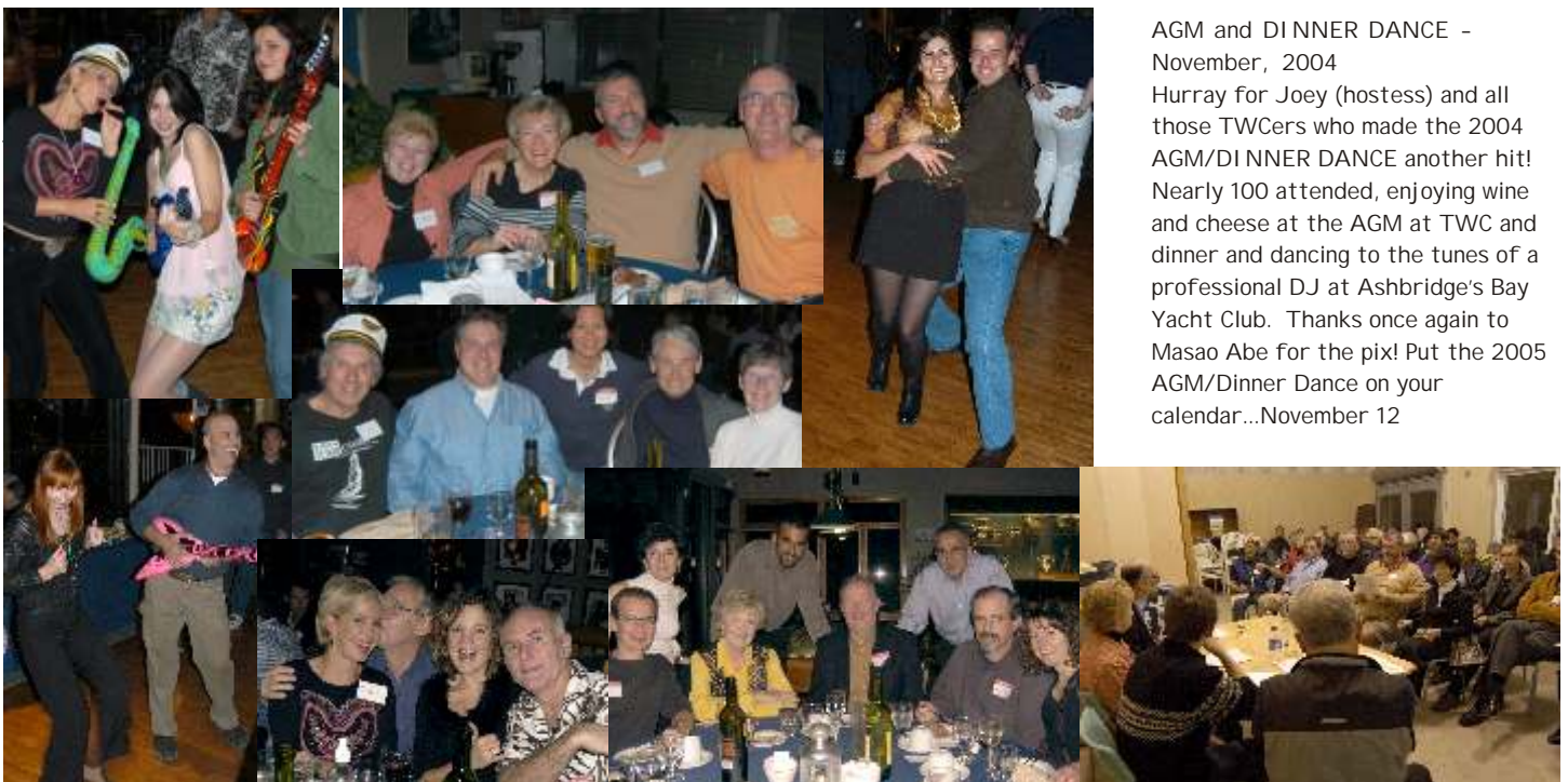
AGM and DINNER DANCE - November, 2004