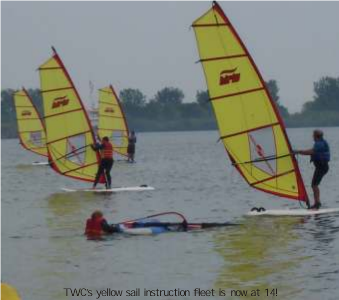
TWC's yellow sail instruction fleet is now at 14!