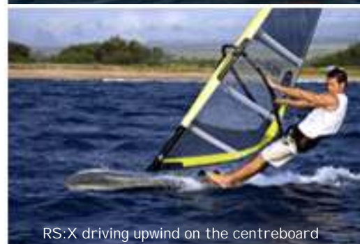
RS:X driving upwind on the centreboard