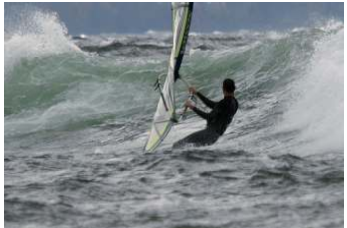
Not every sailing site in Ontario is like Cherry Beach. This one's not Maui...it's Kingston ON!