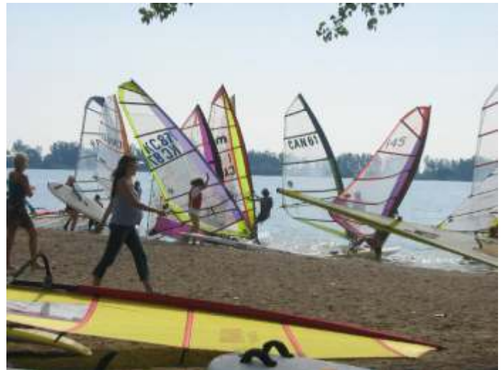
A spectator braves the bedlam of the LeMans start!