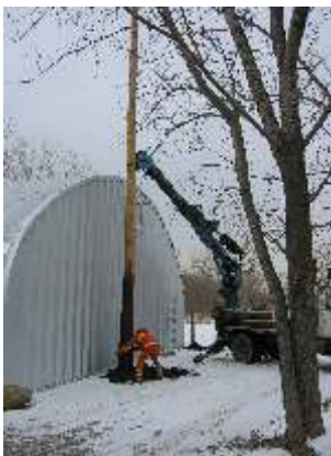
"Now where the !@## do they want that pole anyway?"