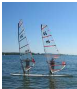
"Gybe??? I thought you said tack!"