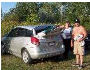
"Board bag? Nah!... I just got the smallest car that'll fit around my board!"