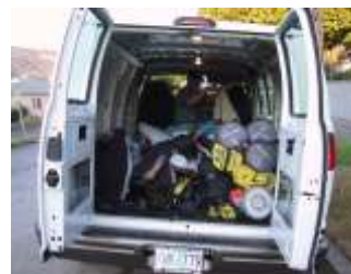
"D'ya think if we got an eighteen wheeler, we could bring the boards too?"