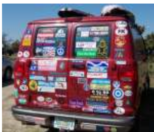
"Whad'ya mean I forgot the validation sticker on my licence plate? There's gotta be one there that'll do!"