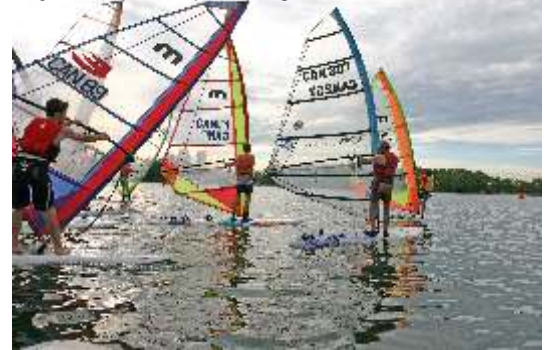
Hayes mixes it up on a light wind start line.